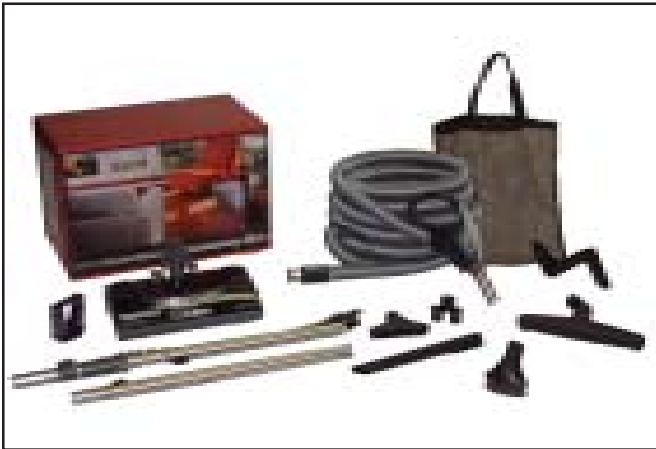
*VSP1S--Direct Connect, VSP2S--6 Ft. Pigtail Cord