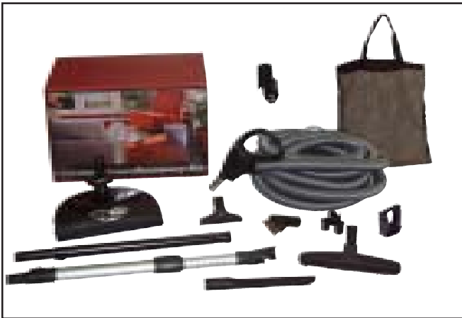
*PEK1--Direct Connect, PEK2--6 Ft. Pigtail Cord